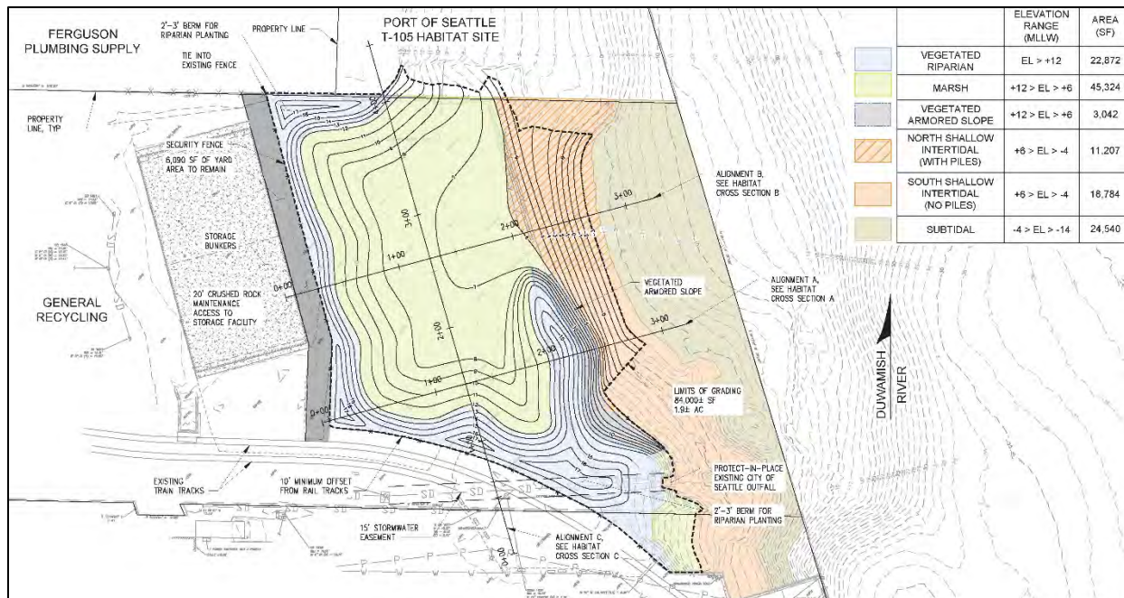
Figure 2: General Recycling Habitat Project conceptual design.