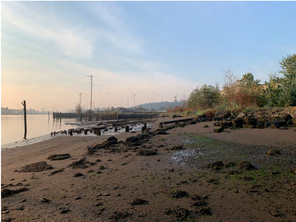
Figure 3: Habitat adjacent to the proposed General Recycling Habitat Project. View of restored shoreline at the adjacent Port of Seattle Terminal 105 Park (tu?əlaltx w Village Park and Shoreline Habitat) to the north. Current conditions of the General Recycling Habitat Project can be seen in the background.

Federally-listed threatened species under the ESA known to be or that may occur in the vicinity of the Preferred Alternative project area include Marbled murrelet, Yellow-billed cuckoo, Coastal-Puget Sound bull trout, Puget Sound Chinook salmon, and Puget Sound steelhead (U.S. Army Corps of Engineers, 2000; NOAA, 2014a). The LDR, where the Preferred Alternative project is located, is essential fish habitat (EFH) for Chinook, coho, and pink salmon (NOAA, 2014b), groundfish (NOAA, 2006), and coastal pelagic species (PFMC, 2021). Federal species of concern under the ESA known to be or that may occur in the vicinity of the Preferred Alternative project area include the bald eagle (USFWS, 2007).