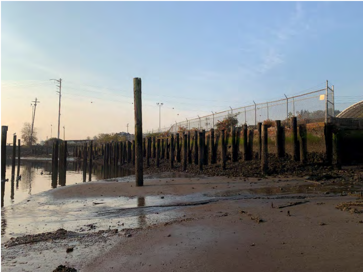
(View of current conditions at General Recycling property from shoreline.)

Draft Restoration Plan/Environmental Assessment March 2024