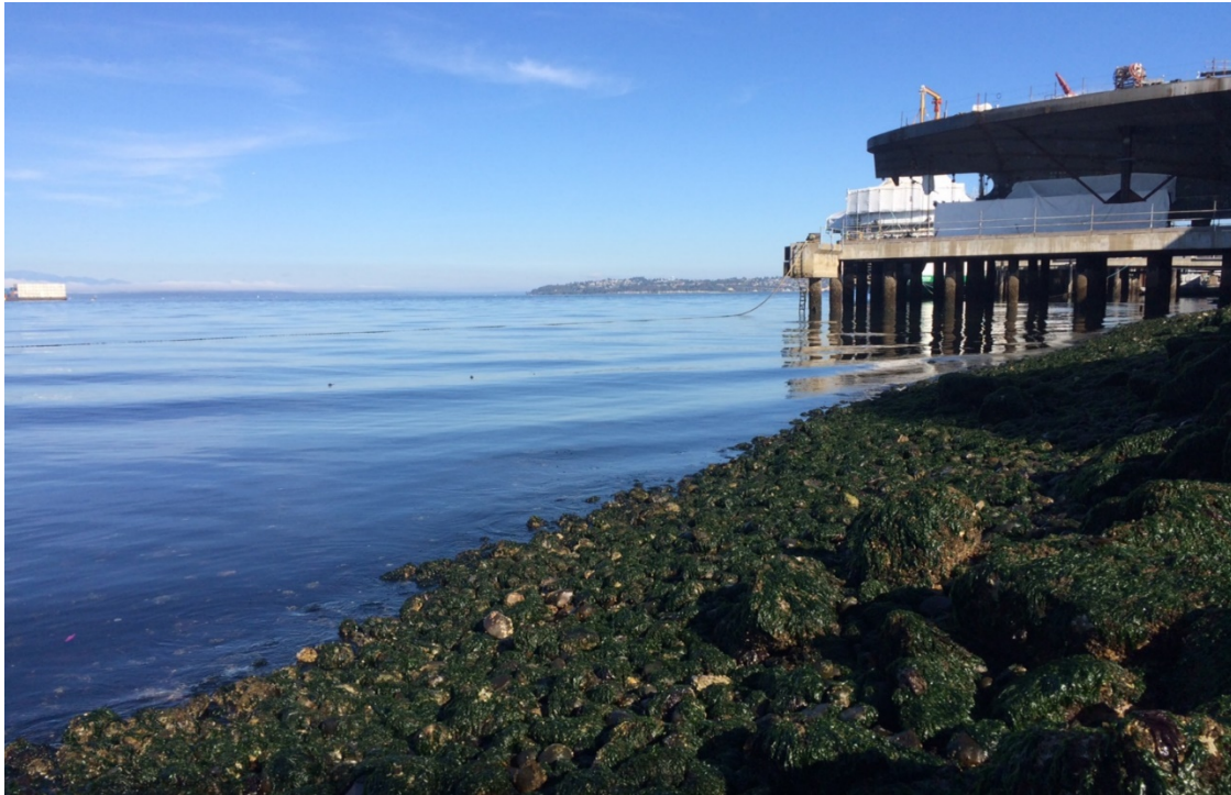
(View looking north of the West Waterway Habitat Bench Project.)