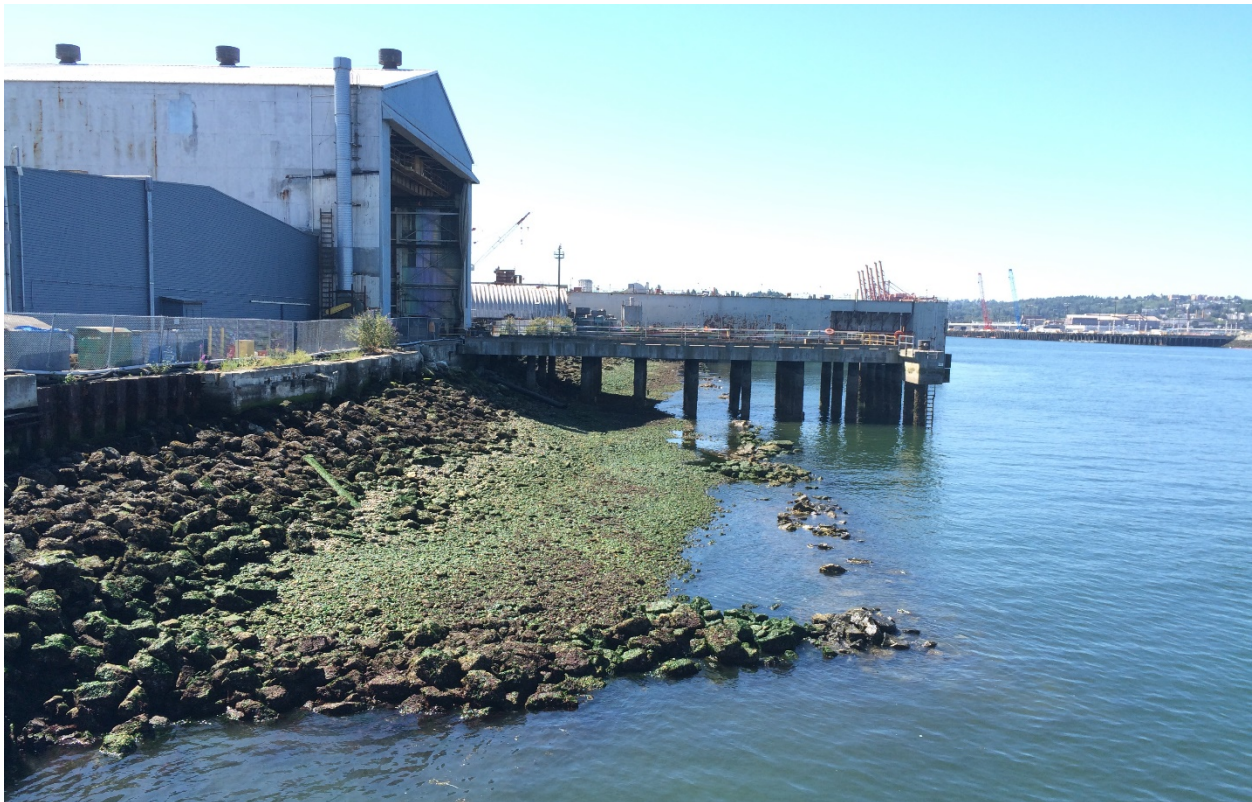
(View of West Waterway Habitat Bench Project, looking south.)

creation and conservation. Vigor and Exxon would be required to monitor and maintain the WW Bench Project for the initial 30 years after the entry of the consent decree to guarantee that the WW Bench Project habitat will continue to function to support natural resources injured by hazardous releases and discharges of oil. After the initial 30 years, the Trustees would require Exxon and Vigor to implement a long-term stewardship plan. Implementation of the permanent protection and monitoring and maintenance requirements for the WW Bench Project is contingent on the Court entering the consent decree between the Trustees, Exxon, and Vigor.