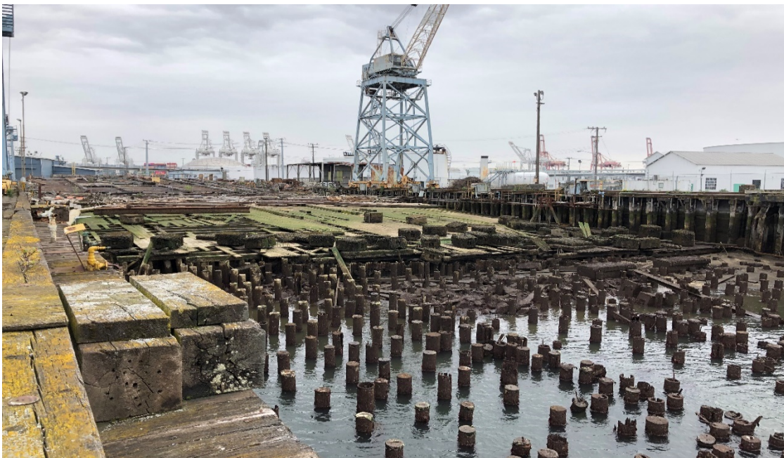
(Vigor shipways to be demolished for Southwest Yard Habitat Project. Photo credit: Floyd | Snider)

Historically, the LDR was forestland, intertidal flats, and freshwater and estuarine wetlands. Beginning with industrialization in the early twentieth century, the LDR became increasingly altered and is now mainly industrial and residential development. The LDR is restricted along both banks by levees or rock revetments and is periodically dredged between its mouth and river mile 5.5. Approximately 99 percent of the former estuarine wetlands and mudflats have been either dredged or filled for industrial purposes (U.S. Department of the Interior, Fish and Wildlife Service, 2000; U.S. Army Corps of Engineers, 2000).