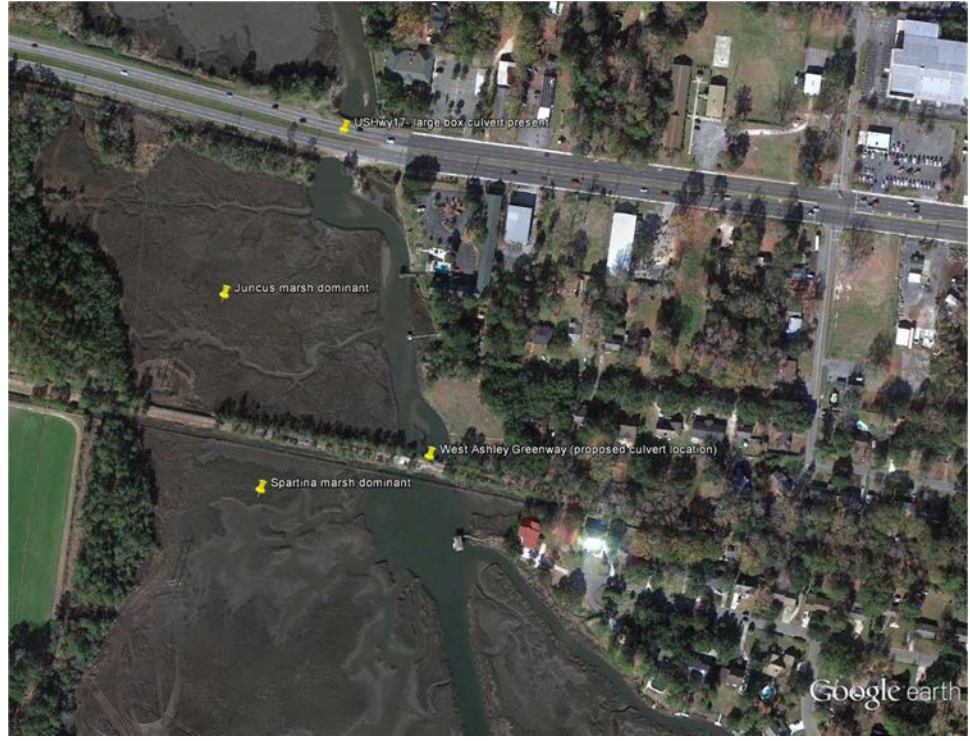
Figure 6.3 Satellite View of the Long Branch Creek Project Site

The project consists of enhancing and restoring approximately 45 acres of tidal salt marsh and fishery habitat within Long Branch Creek, Charleston, South Carolina (Figure 6.3). Work includes removing three undersized, failing 48" pipes running under the West Ashley Greenway (Greenway) and creating a breach that will provide tidal exchange above and below the causeway. Like the Drayton Hall project, restoring natural hydrology to the salt marsh system will improve the overall health and function of benthic and marsh habitat.