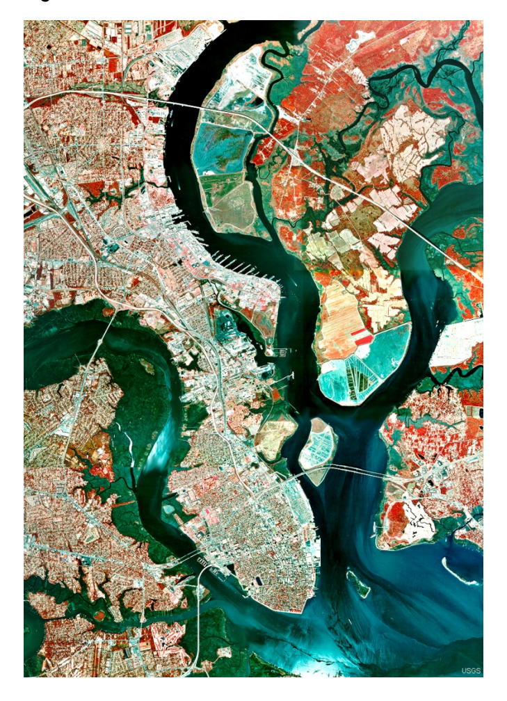
Figure 3.1: Aerial View of Charleston Harbor

freshwater upriver, and the tide that provides the energy that mixes the fresh and saltwater. The average depth of the estuary basin is 12 feet (3.7 m) at mean low water (MLW), but navigation channels have been deepened to 40 feet (12.2 m) MLW. The mean tidal range is 5.2 feet (1.6 m), and spring tides average 6.2 feet (1.9 m). Water temperatures range from 38°F to 87 °F (3.5°C to 30.7°C) and average 67 °F (19.4°C). Salinities range from 0 to 35.6 parts per thousand within the estuary. Similarly, dissolved oxygen levels range from 0 to 17.1 milligrams per liter averaging 7.3 mg/l over the entire estuary.