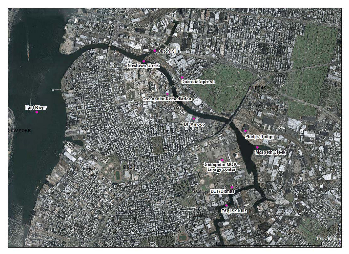
Figure 1. Newtown Creek Assessment Area

The Newtown Creek Superfund Site was added to the National Priority List in 2010. Newtown Creek forms a portion of the boundary between the Boroughs of Brooklyn and Queens, in Kings and Queens Counties, New York. Newtown Creek includes the tributaries of Dutch Kills, Maspeth Creek, Whale Creek, East Branch, and English Kills. The entire Creek system is approximately 3.8 miles in length and discharges to the East River near Hunter's Point and Roosevelt Island (USEPA 2009) (Figure 1). It flows through a highly industrialized area, is estuarine, and experiences tidal fluctuations of approximately two to six feet (New York City Department of Environmental Protection [NYCDEP] 2011). Newtown Creek is classified by the NYSDEC as Class SD saline water, a NYSDEC classification that indicates the best use of this Creek is fishing and that the waters should be suitable for fish survival. However, since 2004, Newtown Creek has been listed on the U.S. Environmental Protection Agency (USEPA) Clean Water Act 303(d) list as impaired due to oxygen depletion.