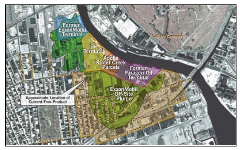
Figure 2. Greenpoint Areas of Remediation