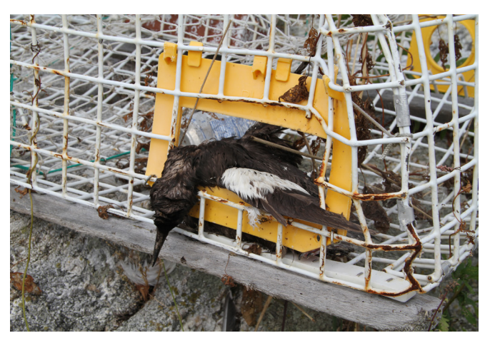
Guillemot entangled in lobster trap.

Although very few studies have quantified precise numbers of birds lost due to derelict fishing gear in Gulf of Maine region's waters, studies from other parts of the world may provide insight on the magnitude of potential impacts. Using bottom trawl surveys in Puget Sound and the Northwest Straits, the Washington Department of Fish and Wildlife (WDFW) estimated