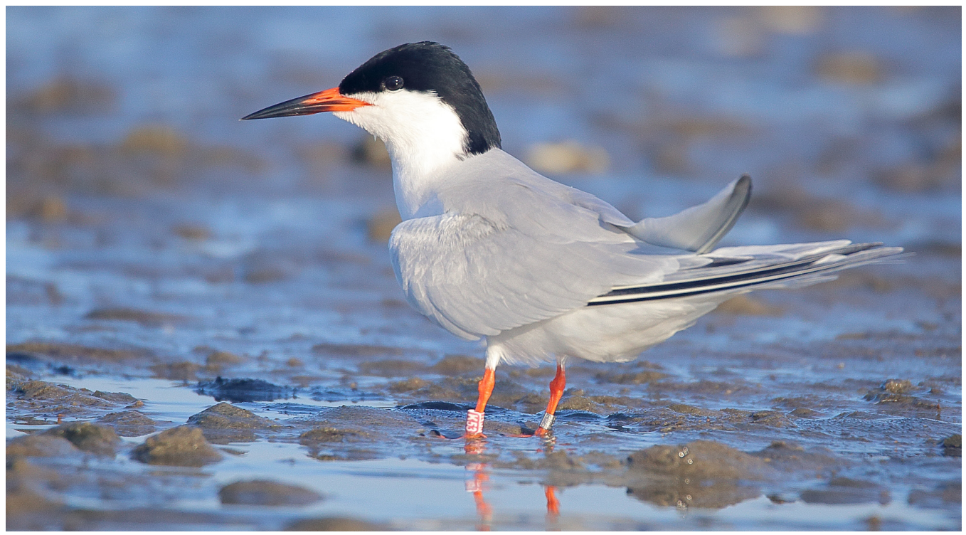
Roseate Tern. Scott Heron, Creative Commons

[H] Plastic pollution in seabird pellets: Compared plastic types and loads in species with different foraging strategies (Herring and Black-backed Gulls; Common and Roseate Terns) based on pellet analysis from Appledore Island (ME) samples. Research presented in Caldwell et al. (2019). Also determined which biological sample types to focus future efforts on and analyze.