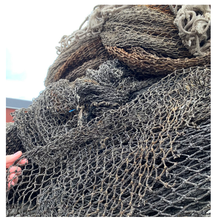
Above: Taking samples of fishing nets to be recycled.

Emphasizing open communication between state/provincial and federal agencies, and local fisher organizations can also aid in the recovery efforts for derelict fishing gear. In Canada, the Department of Fisheries and Oceans (DFO) has used their Sustainable Fisheries Solutions & Retrieval Support Contribution Program (known more simply as the "Ghost Gear Fund") to authorize and encourage fishers and other members of the public to report