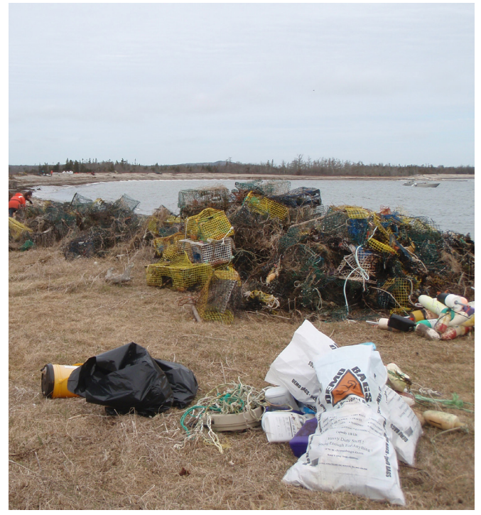
Lobster traps and other debris pulled from the water during a clean up in the Gulf of Maine. Linda Welch

Of the various types of marine debris found in the Gulf of Maine region, derelict fishing gear is one of the most extensive and widespread threats to seabirds and other marine life. Derelict fishing gear is described as recreational or commercial fishing nets, lines, ropes, traps, and buoys which are lost, abandoned, or discarded in the environment. According to reports from the Food and Agriculture Organization of the United Nations, about 640,000 tons of derelict fishing gear is added to the ocean yearly, which is approximately 10% of the world total of marine debris (Macfadyen et al., 2009). Fishing gear can become "derelict" through accidental loss at sea due to gear conflict (when nets or rope from different vessels or fisheries become entangled), misplaced or poorly placed gear, irregular seafloor topography (where nets, traps, and rope become stuck on the seafloor or chaffed on the rocky bottom), and adverse weather (Hammer et al., 2012). Additionally, fishing gear can be intentionally abandoned at sea, which can happen to conceal illegal fishing practices or because of disposal costs. Multiple inquiry respondents and other project partners have reported nets and traps being discarded at sea when damaged because it can be cheaper than