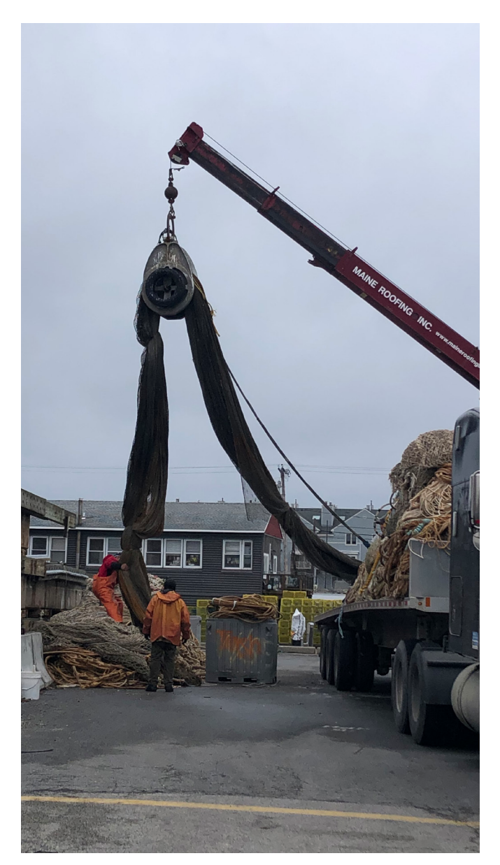
GOMLF working with fishermen to provide proper disposal for end-of-life nets which includes repurposing and recycling. Gulf of Maine Lobster Foundation

Proper storage of traps and fishing gear, once removed from the water, can also help reduce their impacts on coastal bird species. Cline & Hatt (2011) recommended that thorough removal of bait would prevent luring of birds to traps when they are pulled from the ocean for storage. Elimination of residual bait is especially important if trap storage occurs during periods when food for terrestrial birds is limited. During times of low food availability, birds are more likely to seek out new or additional food sources, including bait, incidental bycatch, or remnant invertebrates that may not have been thoroughly cleaned out of the traps. Because the structure of these piled-up traps may also attract a variety of passerines, storing traps indoors can limit interactions. Traps that need to be stored outdoors should have their entrance funnels obstructed, thus preventing unintended capture of terrestrial birds. Traps could also be covered (e.g., with a tarpaulin) to further protect against inadvertent trapping.