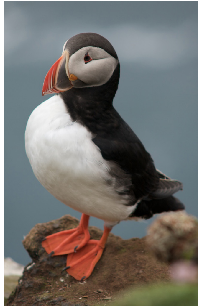
Atlantic Puffin are one of nearly two dozen species documented to have been affected by marine debris in the Gulf of Maine Region.

[H] Collaborative Remediation of Abandoned, Lost, and Discarded Fishing Gear: Collaborative effort