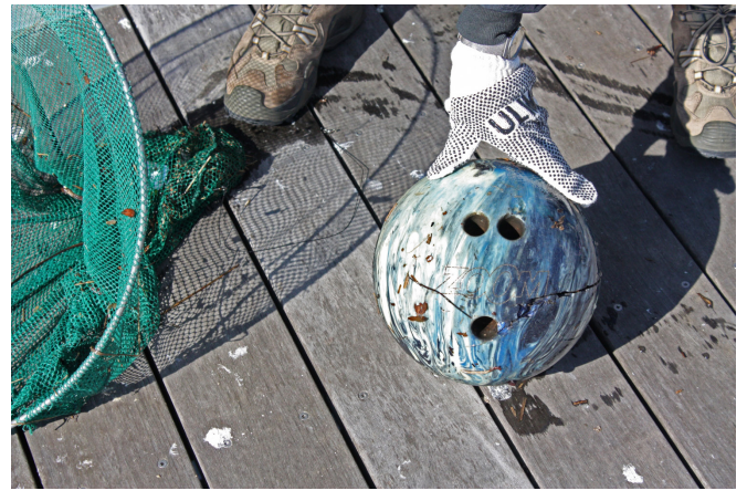
Cracked bowling ball found during beach cleanup.

Consumer litter is generally derived from landbased sources (Nelms et al., 2017) but can end up in waterways, and ultimately the ocean, affecting coastal and seabirds in the Gulf of Maine region. Consumer litter, which includes plastic bottles and caps, balloons, plastic bags, cigarettes, food packaging, and various other commercial and industrial items, can accumulate in the marine environment due to improper consumer disposal, faulty recycling management, and industry use of excessive plastic packaging. The tourism industry in the Gulf of Maine attracts huge numbers of visitors every year. Although this provides an economic boom for the region, it also has the potential to add a large amount of consumer