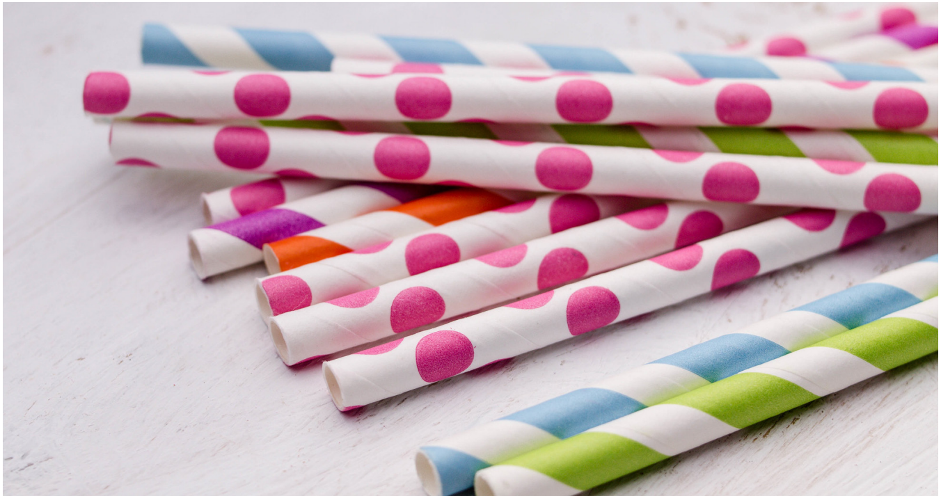
Restaurants and other retailers can institute policies to help reduce straw waste, such as limiting them to customers only upon request, and only offering straws composed of natural fibers (bamboo, hay, cardboard, etc.). Creative Commons