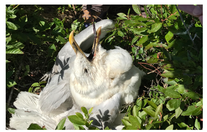
Herring Gull found at a seabird colony on Appledore Island (ME), fatally entangled in fishing line. The line also wrapped around a shrub, preventing the bird from freeing itself. Sarah Courchesne

Although impacts of incorporating marine debris into breeding colonies and nests are not well studied, such impacts may include both entanglement/entrapment and ingestion (Bond et al., 2012). Some seabirds collect anthropogenic debris to use as nesting material (Hartwig et al., 2007) increasing entanglement probability at breeding sites. The likelihood of birds selecting marine debris for nest construction depends in part on the availability of natural materials close to the nest site (Witteveen et al., 2017). Votier et al. (2011) conducted a study that focused on nest incorporation by observing the third largest colony (approx. 40,000 pairs) of Northern Gannets (Morus bassanus) in the world, located in Grassholm, Wales. They estimated that 18.46 tons of plastic was present in gannet nests in this single colony, with content dominated by rope