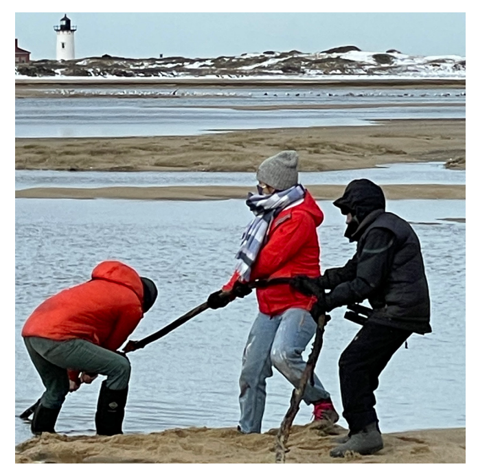
Many local entities organize local beach clean ups for people of all ages to participate in.

By partnering with local entities and the public, beach clean-up programs can be an effective way to keep consumer litter from becoming harmful marine debris while engaging members of the public who may be wondering what they can do to help. Ocean Conservancy's International Coastal Cleanup is a global