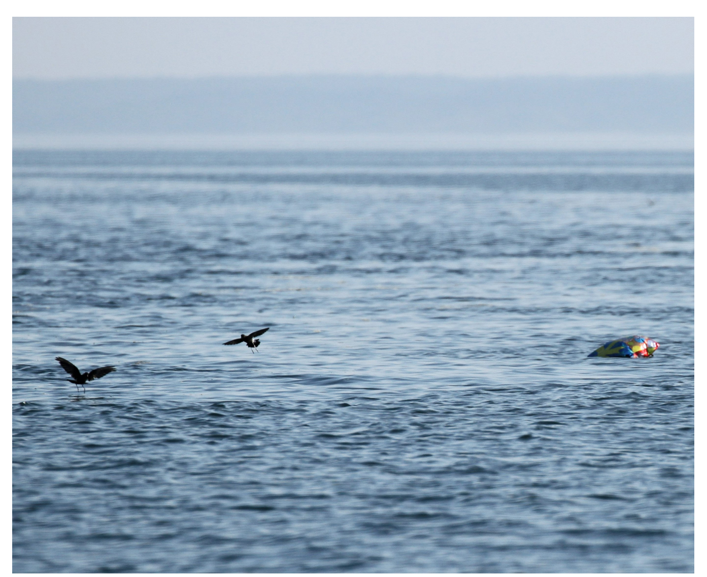
Storm petrels fly near a balloon in the Gulf of Maine. Balloons are a widespread and particularly dangerous type of marine debris for birds, who can mistake them for food. Lisa Sette