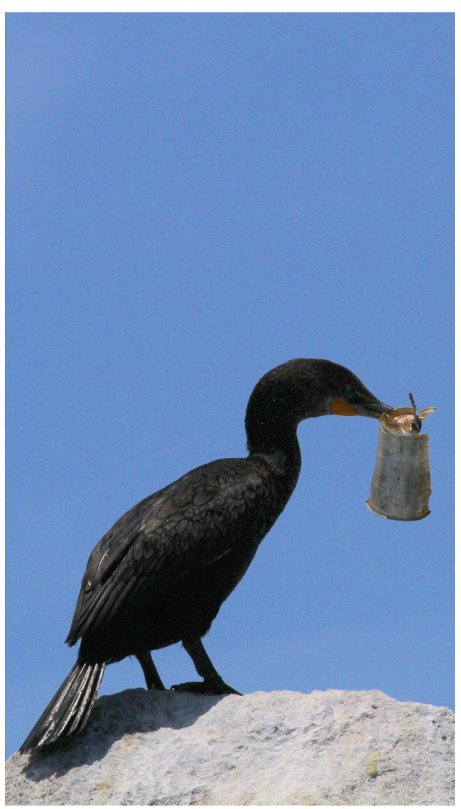
Double-crested Cormorant with disposable plastic cup. Lisa Sette

Understanding how loss of habitat affects breeding success and mortality of nesting seabirds is another area requiring more data to adequately assess. An important first step for understanding impacts on productivity and mortality is to examine and compile available data on debris quantities at colonies and any observed impacts, in a common location to facilitate broader-scale analyses.