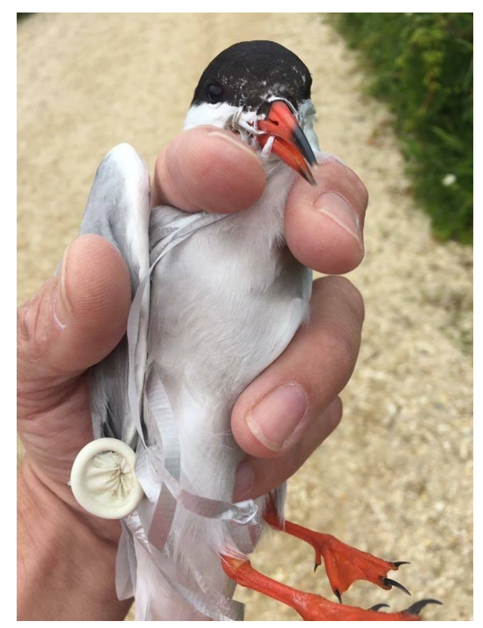
Common Tern in Maine found with balloon string partially ingested. L. Smith

Roman et al. (2019b) examined 1,733 seabird carcasses obtained as fisheries bycatch, from veterinary offices, and that had washed up on shores from Australia and New Zealand. Carcasses were necropsied and debris visible to the naked eye was removed and analyzed. They found that 557 (32.1%) had ingested marine debris, which could be seen as an underestimate due to the size of some microplastics and their difficulty to quantify.