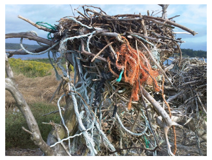
A two year study of breeding cormorants in Maine found that nearly 40% of nests contained plastic debris (Podolsky & Kress, 1989).

See <u>Appendix III</u> for a list of seabirds and marine waterfowl species documented to have been affected by marine debris in the Gulf of Maine region.