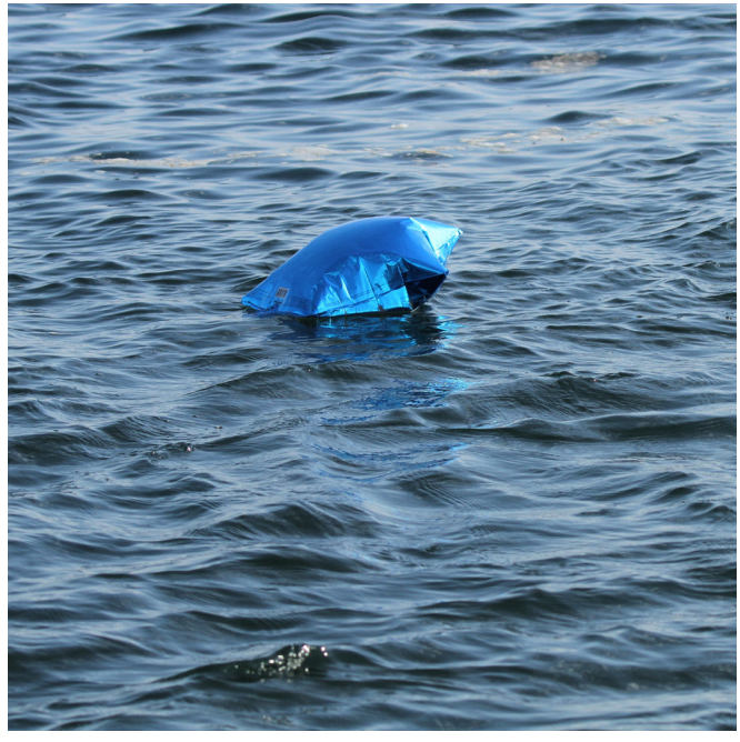
Many states are passing legislation to regulate the intentional release of ballons to help protect seabirds and other wildlife. Lisa Sette

Mylar and rubber balloons have been documented as a major type of consumer litter and are particularly harmful to seabirds when ingested. In July 2021, the State of Maine (LD 618) banned the intentional mass release of balloons in an effort to reduce their environmental impact. The bill prohibits releasing more than 24 balloons at a time and includes fines between $100 and $500. States along the Atlantic Coast, including Rhode Island and New Jersey, are currently considering similar legislation that would deter and eventually stop the intentional release of balloons outdoors. In New Jersey, a 2020 legislative proposal (A4322) was drafted that stated releasing one or many balloons could result in a $500 fine throughout the state. Although this proposal has not been enacted, as of September 2018, fifteen municipalities in New Jersey have passed local bans on the intentional release of balloons. A bill currently proposed in Rhode Island (2020-H 7261) would prohibit any intentional release of balloons except for scientific or meteorological purposes (with government permission), hot air balloon launches (as long as the balloons are recovered), and indoors. At