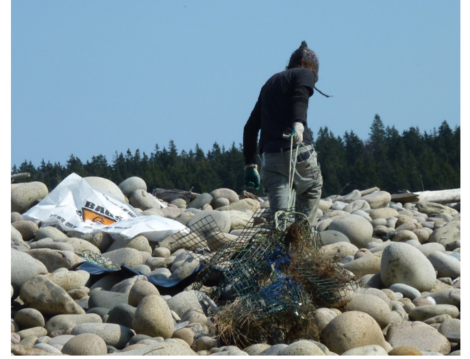
Since 2013, the Center for Coastal Studies has worked with fishers and volunteers to remove over 85 tons of derelict fishing gear. Gear is recycled, upcycled, incinerated, or returned to the owners.

Right: Derelict lobster traps being cleaned up at Frenchboro Preserve, Maine. T. Towne